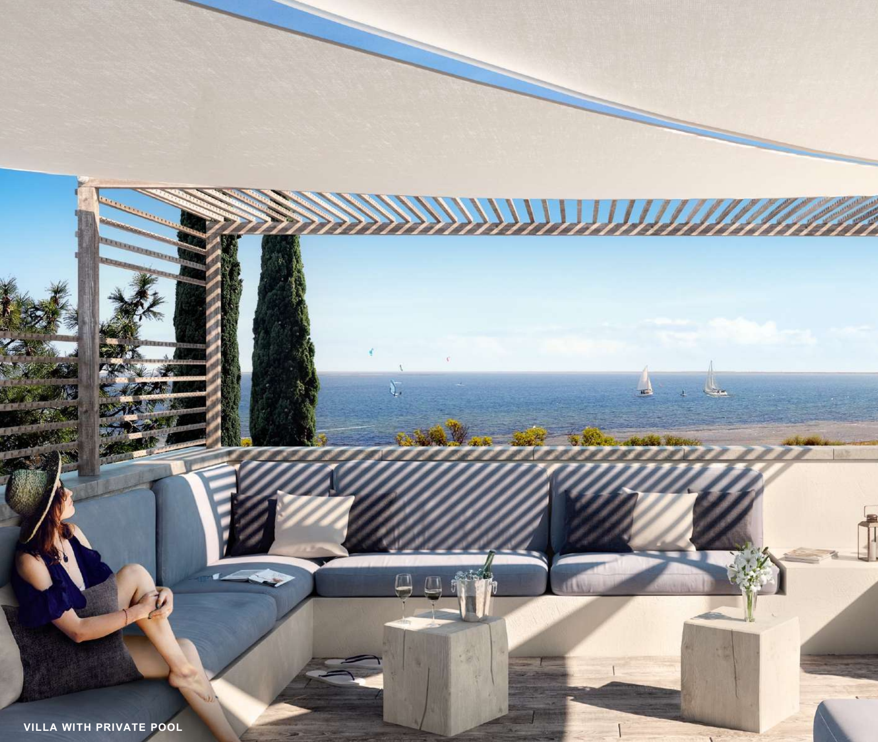
VILLA WITH PRIVATE POOL